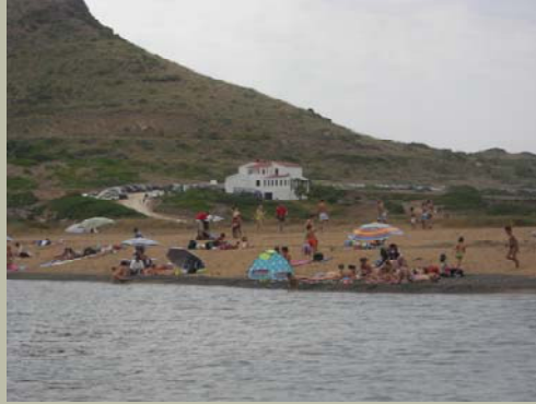
Excessive human frequentation